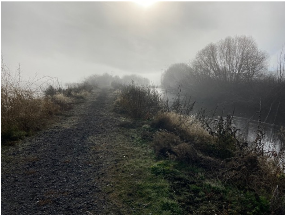
Landscape Second Place: Sarah Gray