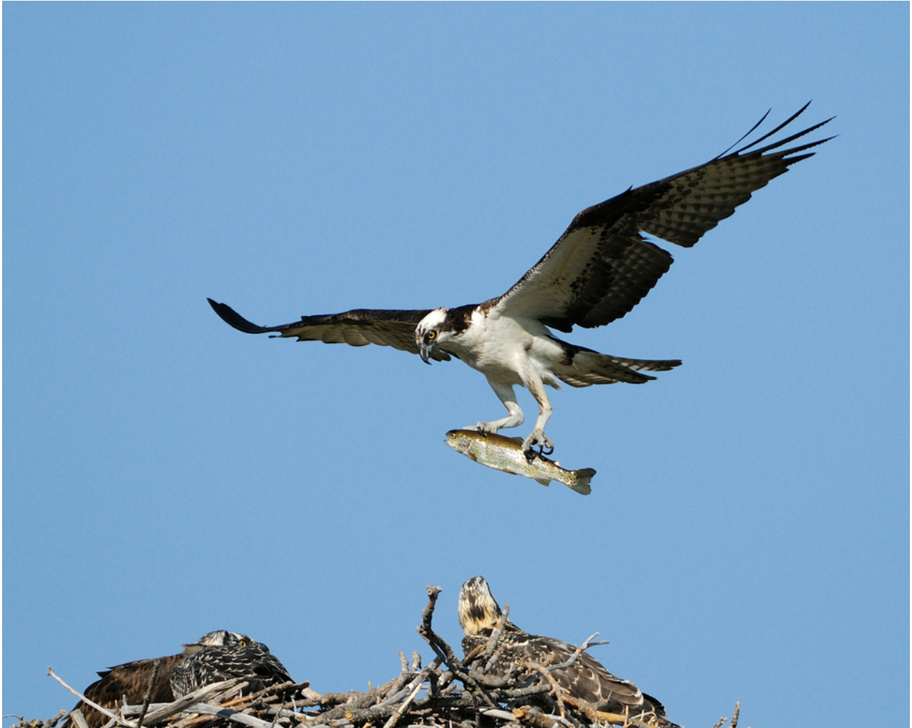
Wildlife First Place: Howard West