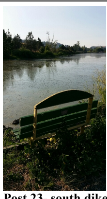
Post 23- south dike