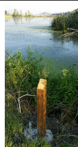
Post 31-crossover area