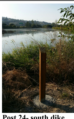
Post 24- south dike