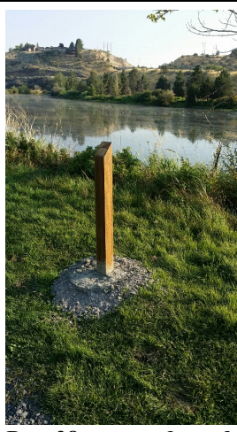
Post 28 - toward pond