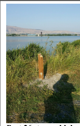
Post 26- toward lake