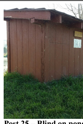
Post 25 - Blind on pond