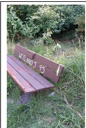
Post 16 - Bench