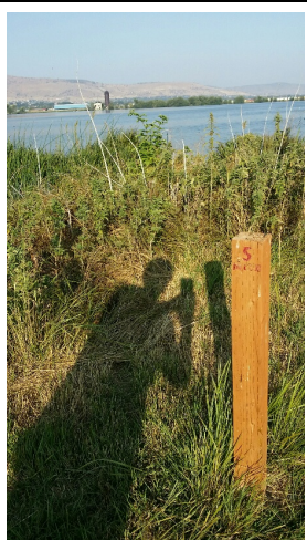
Post 27- toward lake