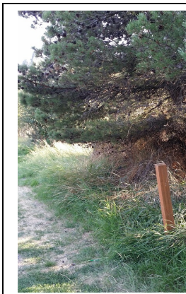
Post 21- also .75 Mile