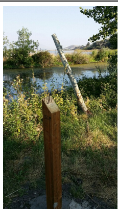
Post 22- on pond