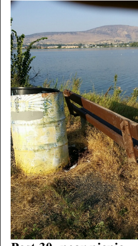
Post 30- near picnic bench