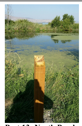
Post 13- North Pond