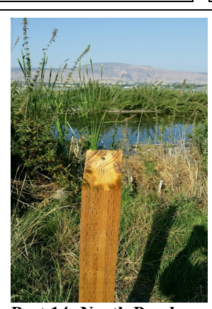
Post 14- North Pond