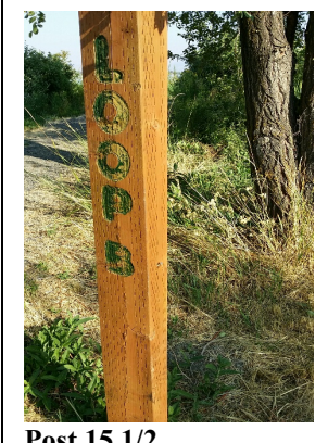
Post 15 1/2