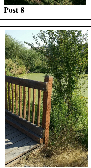
Post 12-Bridge, No. end