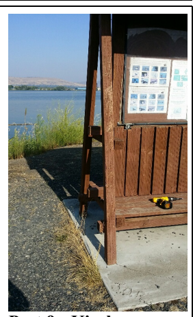
Post 9 - Kiosk