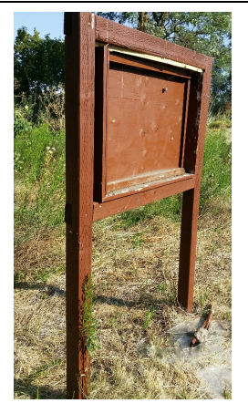
Post 5- Sign for picnic area

These numbers start at the very beginning of the trail, go through a picnic area, and then around Loop B and North Pond.